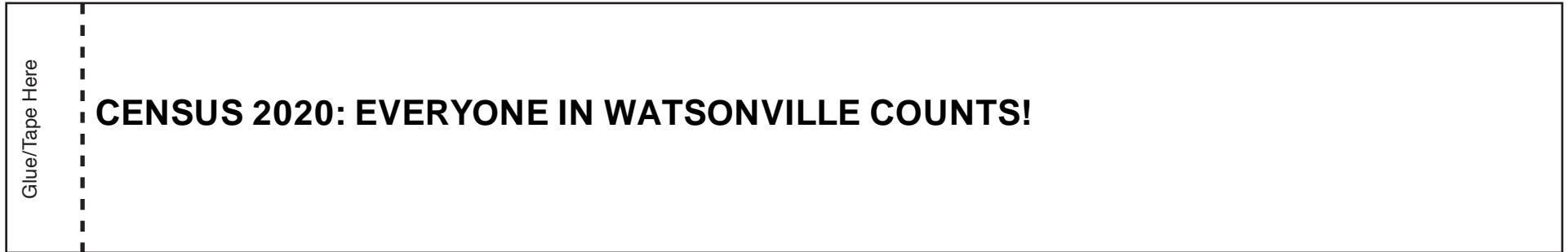
Right Side Piece