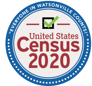
Main Crown Piece